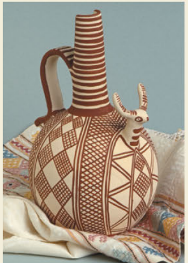
Vessel with painted decoration