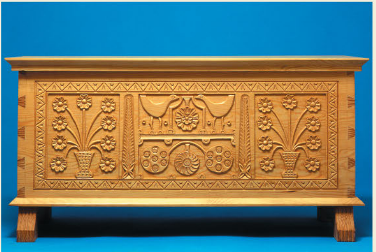
Pine chest with engraved decoration