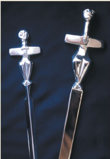
Paperknife with idol