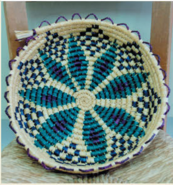
Coloured straw basket