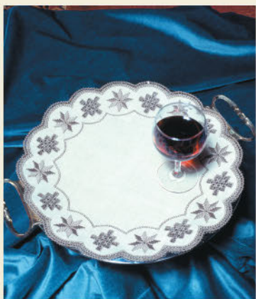
Lefkaritiko embroidery with bobbins