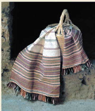
Cotton table cloth "lefkonitziatiko"